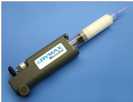
Thumb Activated Micro-Dot Syringe Dispenser (T20000)

The Micro-Dot™ portable syringe dispenser offers positive-displacement accuracy for dispense volumes as small as 0.0003 mL. Once a volume is set it can be repeated with accuracy. This syringe dispenser utilizes a pre-packaged disposable syringe as its fluid reservoir, preventing any contact between the fluids and the dispenser eliminating fluid contamination during dispense. With the proper dispense tip selection, the Micro-Dot is suitable for dispensing a wide range of low-to-high viscosity fluids including pastes, lubricants, adhesives, sealants, and more.