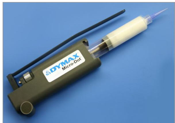
Lever Activated Micro-Dot Syringe Dispenser (T20010)